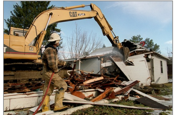
A permit is required to demolish any building, except for residential sheds smaller than 200 square feet

Right-of-way – A permit is required to remove trees that are located in the City right-of-way. Applying for a tree removal permit can be done online through the Tacoma Permits (ACA) portal: https://aca.accela.com/tacoma/ . There is no fee associated with a tree permit for removal of trees within the right-of-way unless the permit is requested for the purpose of view enhancement which requires a separate application form. Please note that a Right-of-Way Bond is required to do work in the city right-of-way. This requirement can be waived if the work abuts a Single-Family Dwelling and the property owner provides a copy of the home owner's insurance with the application.