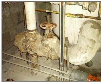
Asbestos pipe fittings

Any proposed demolition of structures that appear to be located within 300 feet of a critical area will be looked at by an Environmental Specialist.