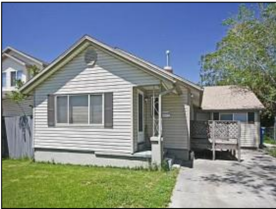
Example of an attached ADU

Otherwise known as a “mother-in-law apartment”, an ADU is – by definition of the zoning code – a complete, independent residence with provisions for cooking, living, sanitation, and sleeping that is a second unit, accessory to the primary single-family residence on the property. ADU's are allowed in certain areas of the City to add affordable units to the existing housing supply, provide an increased choice of housing that responds to changing needs, lifestyles (e.g., young families, retired), and increase density to better utilize existing infrastructure and community resources (i.e. support public transit and neighborhood businesses).