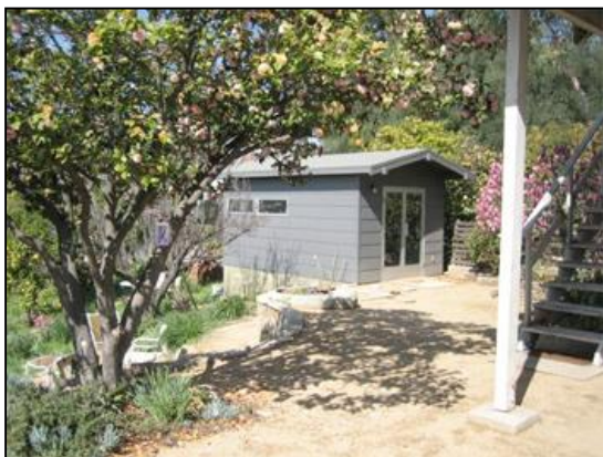
Example of a detached ADU