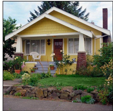
Porch with Architectural Details