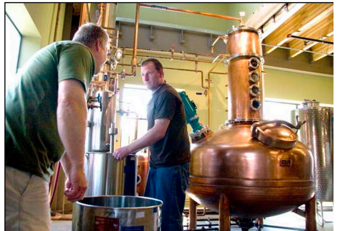
Bainbridge Organic Distillery was one of the first new craft distilleries in Washington to be approved since the WSLCB started issuing licenses.

The Health Department regulates certain aspects of craft distillery operations, such as hazardous waste. For information about Pierce County’s regulations, call 253-798-6500 or visit www.tpchd.org .