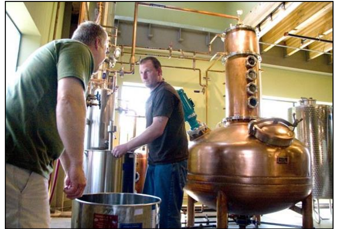
Bainbridge Organic Distillery was one of the first new craft distilleries in Washington to be approved since the WSLCB started issuing licenses.