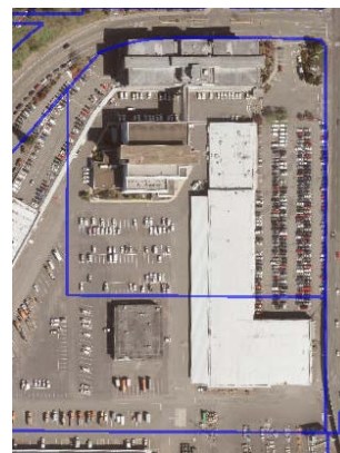
Property lines that cross buildings, like the one shown here, are oftentimes required to be removed via the Lot Combination Process unless it can be demonstrated that the building meets requirements of all applicable Codes.

The Lot Combination Process is the process in which an applicant combines two parcels, generally for the purpose of making a site more desirable for development, or for removing a parcel line that goes through an existing or proposed building. Code requirements do not currently allow for a permit to be issued for a building over an existing parcel lines, except in limited circumstances where appropriate Fire protection considerations have been implemented and where the Zoning Code allows.