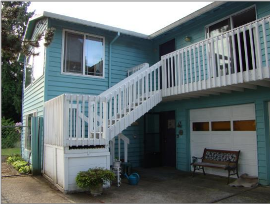
An attached ADU (Dalton home, www.accessorydwellings.org )

Where ADUs are allowed. One ADU per lot is allowed as an accessory use to a single-family detached dwelling, on legally established lots (irrespective of lot size or width) in zoning districts that permit single-family development.