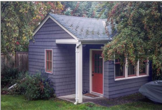
A Detached ADU